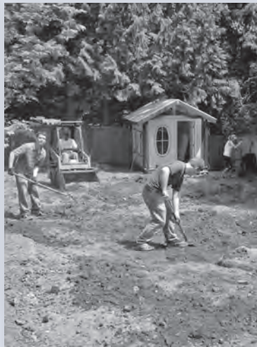
Staff and volunteers leveling back yard for new playground